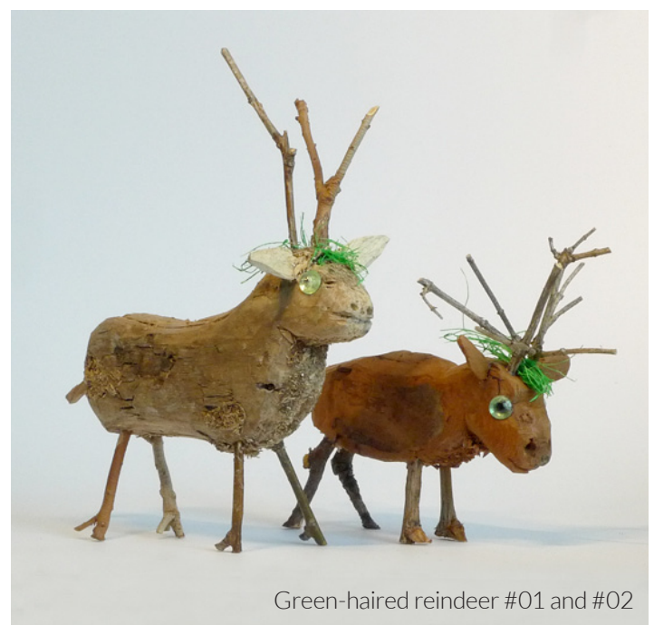
Green-haired reindeer #01 and #02